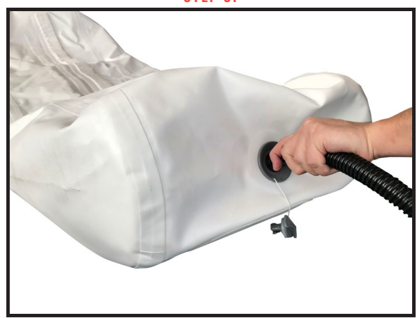
· INSERT AND SECURE PUMP END