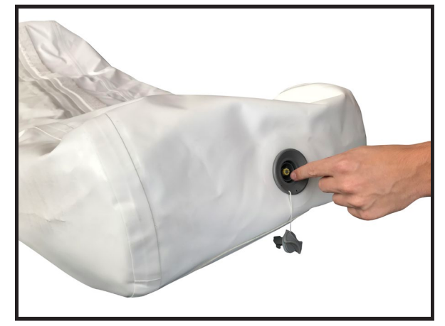
• MAKE SURE INNER VALVE IS CLOSED