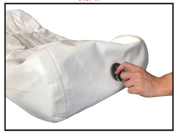
• REMOVE VALVE CAP