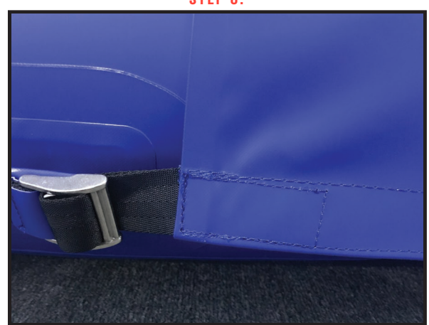
• REPEAT PROCESS FOR EACH WEBBING STRAP