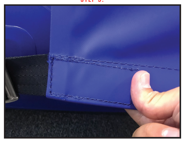
• ENGAGE VELCRO CONNECTION