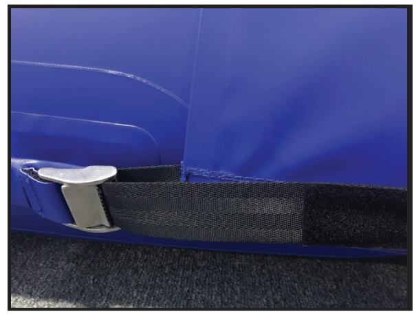
• PULL WEBBING TIGHT