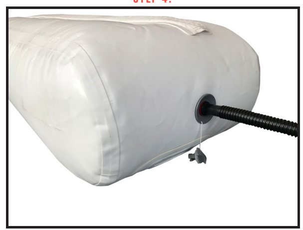
• INFLATE FEATURE