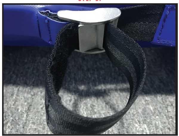
· LOOP WEBBING THROUGH THE BACK OF THE BUCKLE