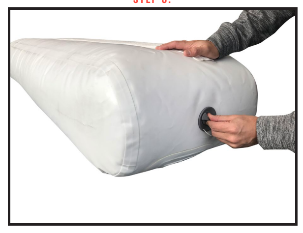
· SECURE CAP BACK IN PROPER CLOSED POSITION