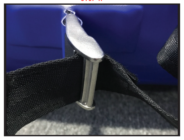
• THREAD WEBBING THROUGH CONNECTION BUCKLE