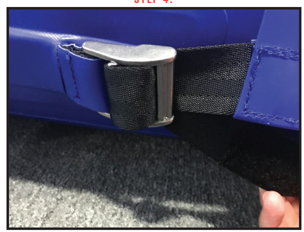
• PULL WEBBING TIGHT