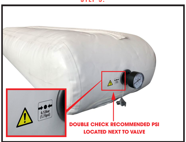
• CHECK FEATURE HAS REACHED RECOMMENDED PSI. SEE PSI CALLOUT NEAR VALVE - DO NOT OVER INFLATE!