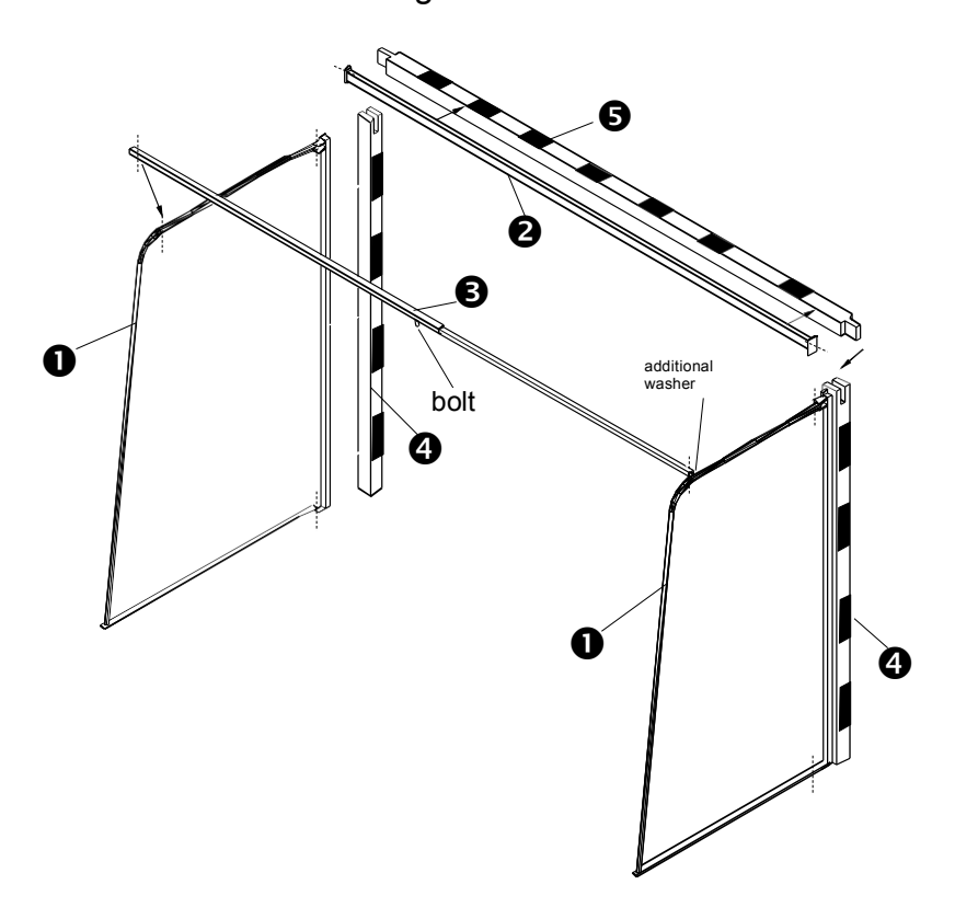
III. 2: Sport-Thieme 'Spezial' handball goal assembly drawing

Ensure you place an additional washer between the side section • and the thinner telescopic bar.